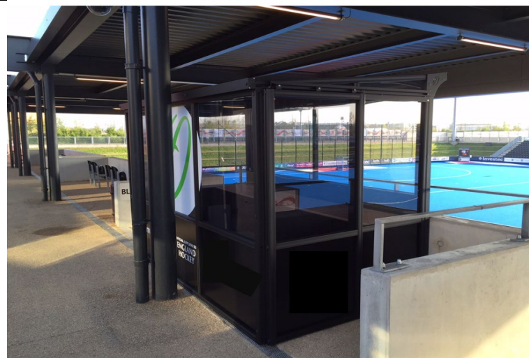
Example of Technical Official's booth – positioned within grandstand