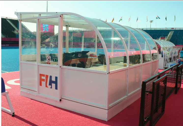
Example of Technical Official's booth – positioned at field level