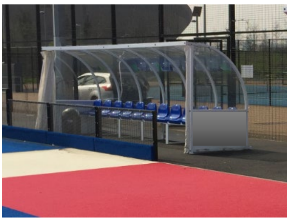
Example of team bench