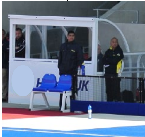
Example of suspended player seats