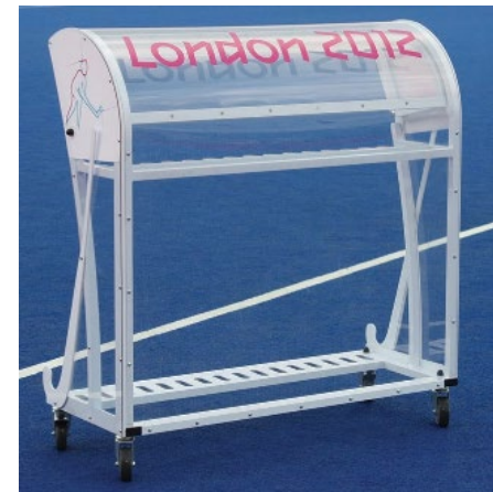
Example of stick rack